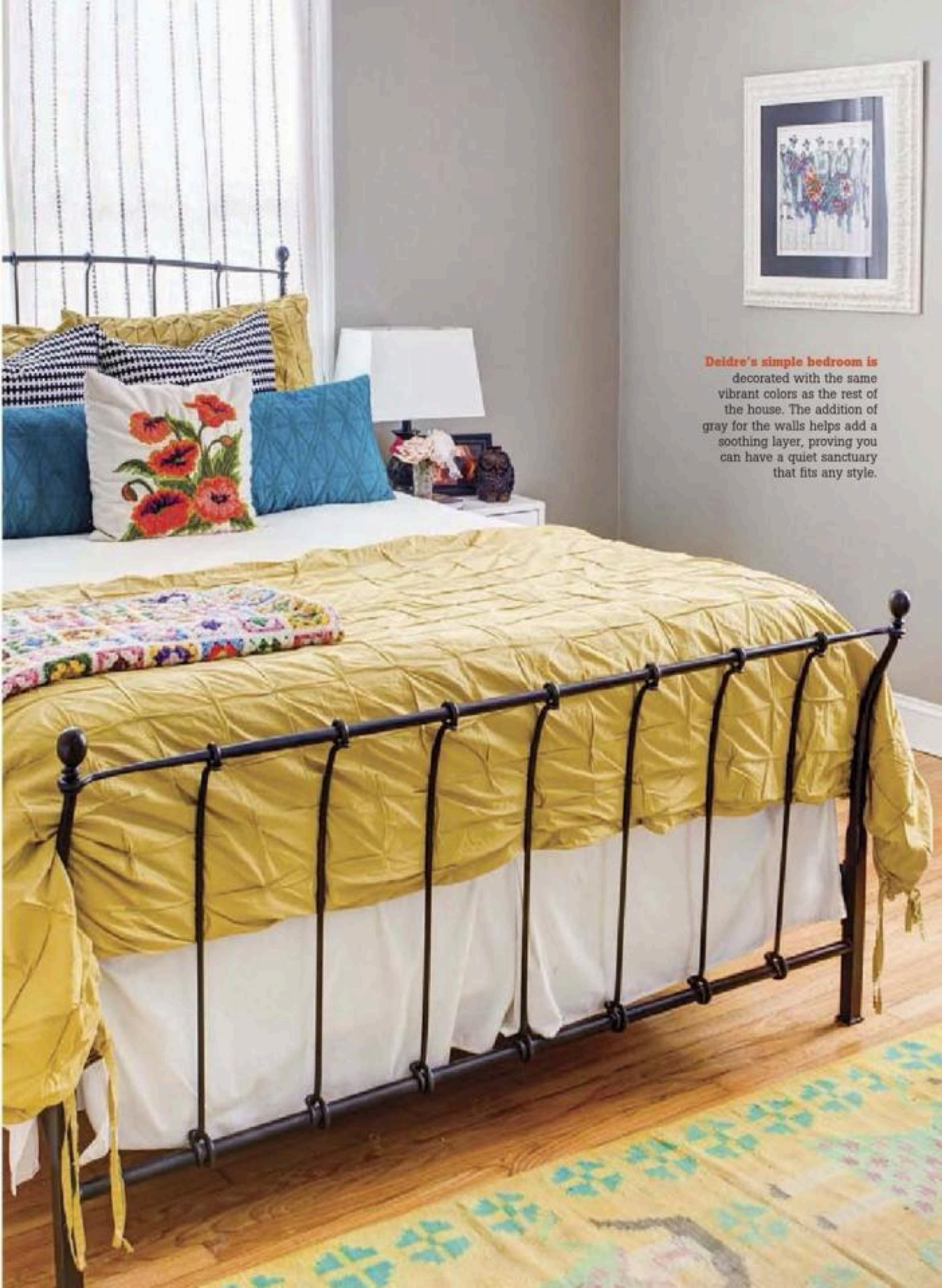
Deidre's simple bedroom is decorated with the same vibrant colors as the rest of the house. The addition of gray for the walls helps add a soothing layer, proving you can have a quiet sanctuary that fits any style.